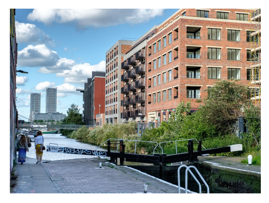
Neptune Wharf